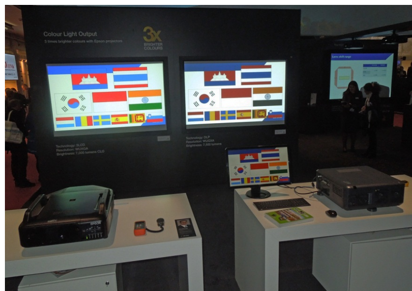
Figure 2. This image shows visible differences in color saturation between a 3LCD projector (left) and a single-chip DLP projector (right). The 3LCD projector is operating at 7,000 lumens and the DLP projector at 7,500 lumens.

For the 1DLP projector to achieve the color accuracy and intensity of the 3LCD image, brightness must be reduced to about 3200 lumens. This is caused by flashing the red, green, and blue segments of the color wheel at greater intervals and blanking during the white color segment. So there is an unavoidable trade-off between high brightness and color accuracy using 1DLP technology, one that does not occur with 3LCD projectors.