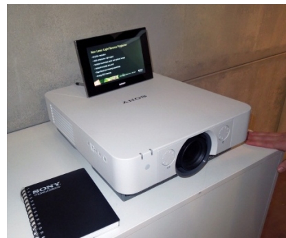
Figures 3a-b: A 4K 3LCD home theater projector (left) and a 4,000-lumen 3LCD projector powered by lasers.

Light sources are changing as well. There is a concerted effort by projector manufacturers to move beyond conventional short-arc lamps that use salts of mercury to more environmentally friendly technology. At present, the leading contenders are lasers (used directly and with phosphor color elements) and light-emitting diodes (discrete red, green, and blue chips). There are also hybrid light engines that combine both lasers and LEDs.